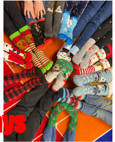
Christmas Dress Up Days