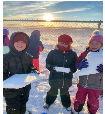
Snow fun and MORE snow fun